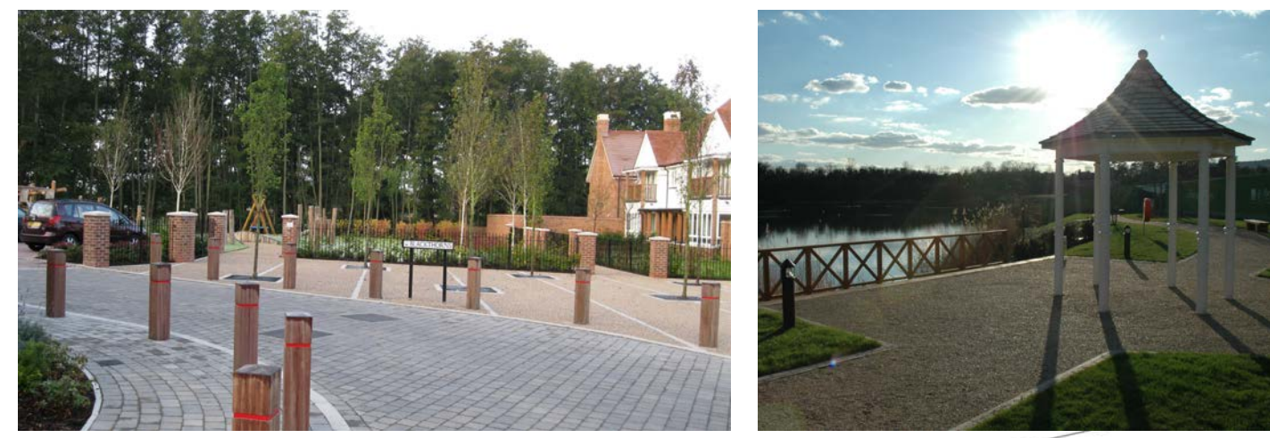
Square with timber bollards to the carriageway