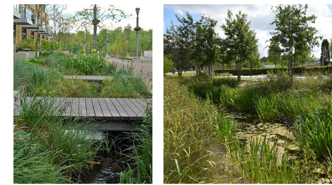
Timber bridge crossing