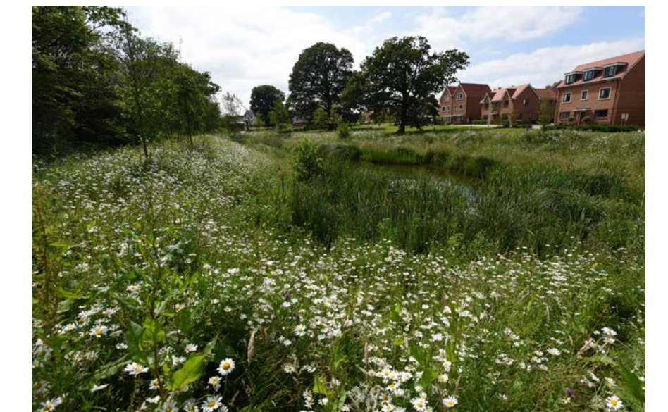
Landscaped attenuation basin